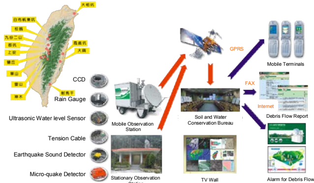
Fig. 1 Fixed and mobiles stations for debris flow monitoring

themselves to a data aggregator before the satellite uplink. Then, the debris flow data may be viewed in real time by connecting to servers at the data center either via the world wide web or a cellular phone. In addition to the satellite uplink, the system may use ADSL, GSM, GPRS, or PSTN networks as backup uplinks when necessary.