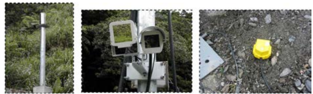
Fig. 3. Different type of sensors.